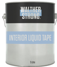
1 LTR WSLT-PRO1