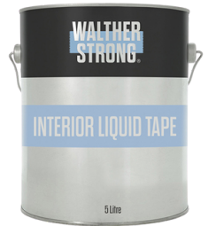
2.5 LTR WSLT-PRO2/5